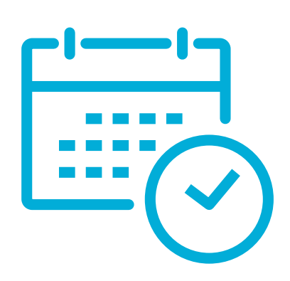
You can often meet with everyone on the team in one visit.

Discover how Rocky Mountain Cancer Centers can help you on your treatment journey by visiting RockyMountainCancerCenters.com.